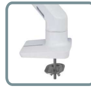
INCLUDED: GROMMET MOUNT ATTACHES THROUGH SURFACE HOLES