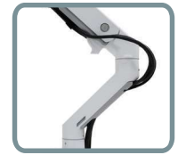
CABLES ROUTE BENEATH THE ARM, OUT OF THE WAY