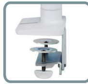
INCLUDED: STANDARD 2-PIECE DESK CLAMP ATTACHES TO SURFACE EDGE