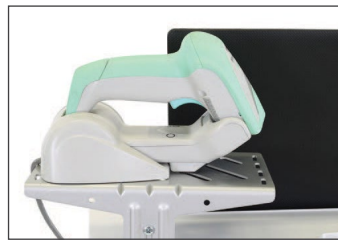
SV Scanner Shelf