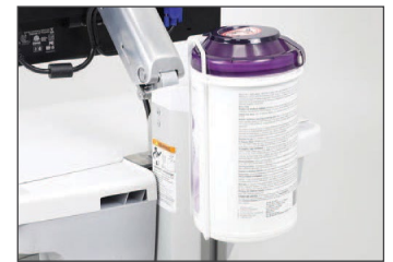
T-Slot Wipes Holder