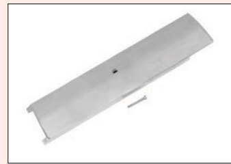
SV Drawer Travel Stop