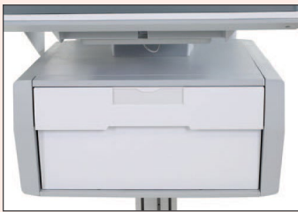
SV Primary Storage Drawer, Single Tall