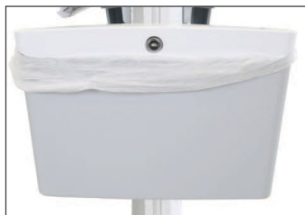
SV Storage Bin