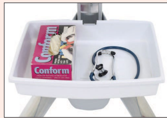
SV Front Tray