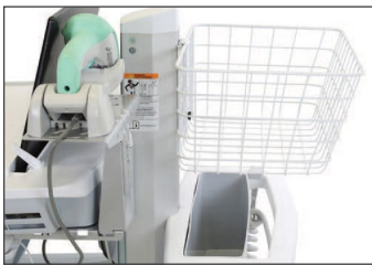
SV Wire Basket, Small