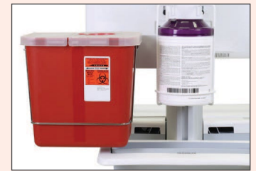
Sharps Container T-Slot Bracket Kit