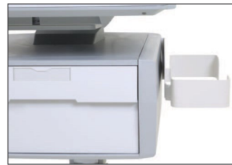
SV Sharps Container Drawer-Mount Bracket Kit