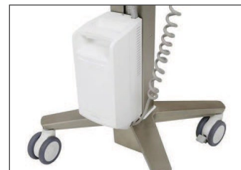
LiFeKinnex™ Power System