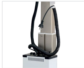
5m Curly Cord for Charging