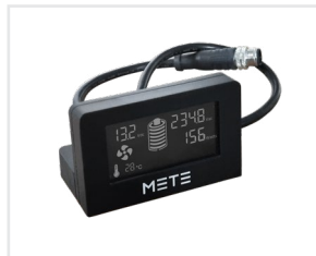
Optional Remote Second Screen