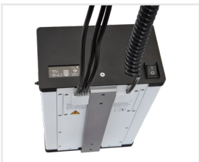
Cable Management System 3x AC Power Out