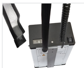
Velcro Cable Wrap