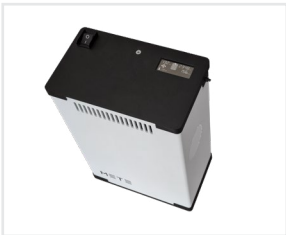
AC Power Switch and Status Screen

Note - A METE unit will run most inkjet printers, but not laser printers.