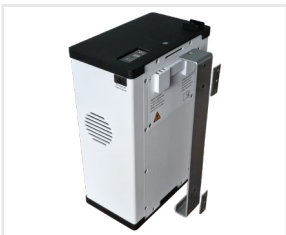
Ergotron Mounting Kit Included