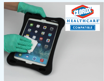
shown: Screen Protector with Seal Shield Bumper for iPad